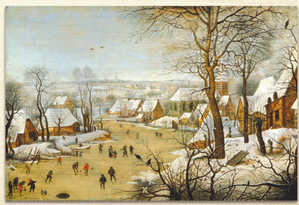
▲ Pieter Bruegel the Elder is best known for his scenes of daily life. In Winter Landscape With Skaters and a Bird Trap, every detail—from the bare trees to the people walking on ice—conveys the white and frozen reality of northern Europe in winter.

Northern European artists eagerly pursued realism in their art. The new technique of oil painting allowed them to produce strong colors and a hard surface that could survive the centuries. They also used oils to achieve depth and to create realistic details. Artists placed a new emphasis on nature, recording in their art what they actually saw. Landscapes became a major theme, not just the backdrop to human activities.